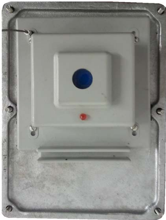
6.5 lbs / 2.95 kg