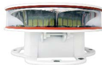
L-865 / L-864 Dual Red / White Beacon