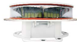
L-866 / L-885 Dual Red / White Catenary Strobe