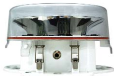
L-864 Red Medium Intensity Beacon